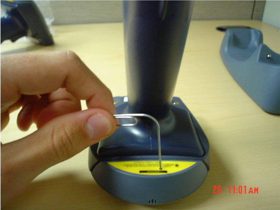
Step 3. Flip cradle over and set to appropriate communication method,